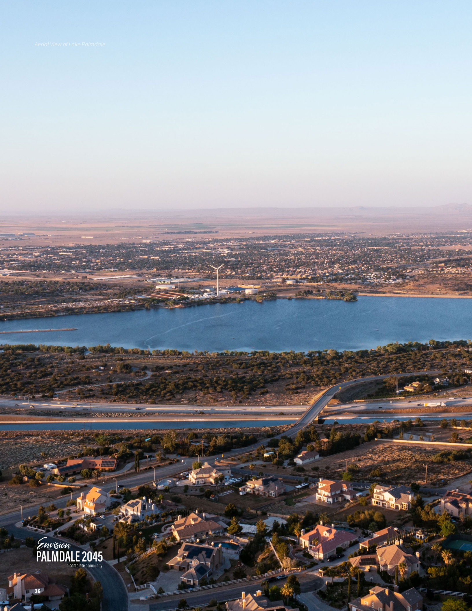
Aerial View of Lake Palmdale

Envision PALMDALE 2045 a complete community